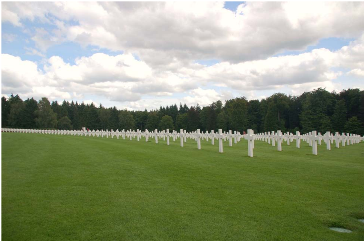
The American Cemetery in Luxembourg

Just a short drive from the Bastogne Memorial is the American Cemetery in Luxembourg. Gen George Patton is buried here with his troops. This is one of 25 permanent US Military Cemeteries located on foreign soil. At Gen Patton's direction, his engineers selected sites for both U.S. and German dead because he knew that losses would be very high on both sides. The US Army Burial Service recovered and buried, in these two sites, the remains of over 10,000 U.S. and German soldiers killed in the Ardennes area during that winter. Both sites were supposed to be temporary but the people of Luxembourg asked to make the American Cemetery permanent and about 50% of the next of kin agreed. The Grand Ducal Government of Luxembourg gave the U.S. free use of the 50.5 acre cemetery in perpetuity. In the cemetery there are 5,075 American Military Dead including 22 sets of brothers (buried side-by-side). 101 headstones mark the graves of those whose remains could not be identified. The names of 371 of our Missing in Action are inscribed on two large granite pylons. The American Cemetery is an awe inspiring and a fitting tribute to the bravery of these heroes.