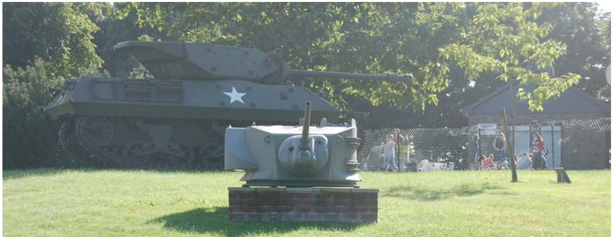
Armor outside the museum entrance

Just down the path from the memorial is the museum. Well worth the price of admission it contains a large number of well displayed artifacts. The audio tour and the movie are well worth the price and your time.