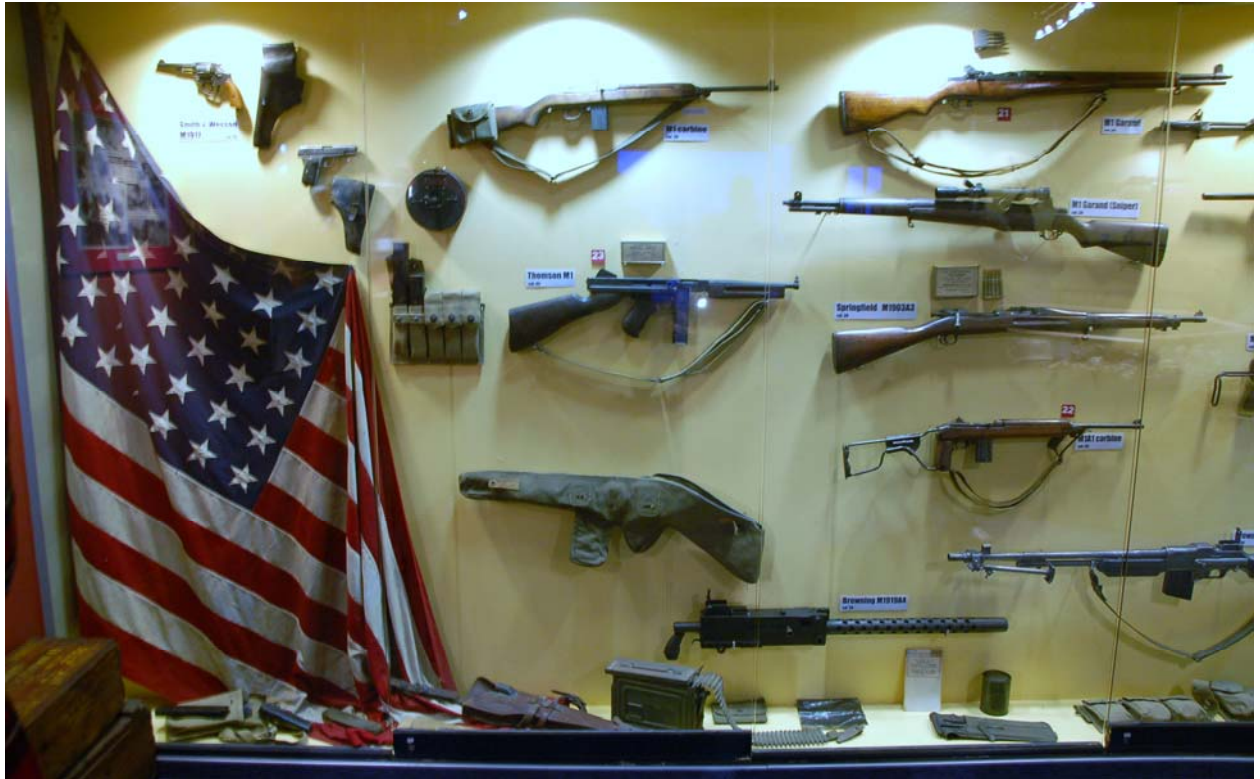
One of the museum's three Tommy Guns in a case with other weapons used during the battle