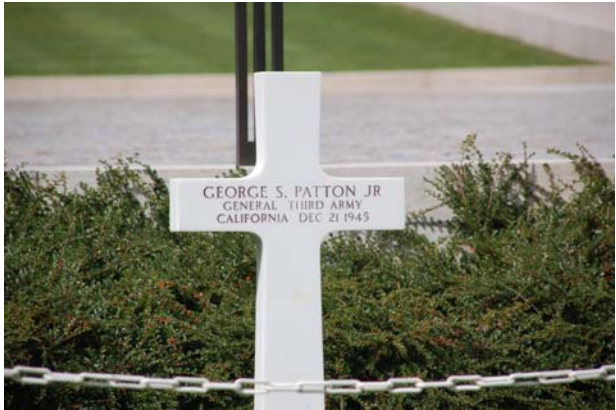
The grave of General George S. Patton Jr.