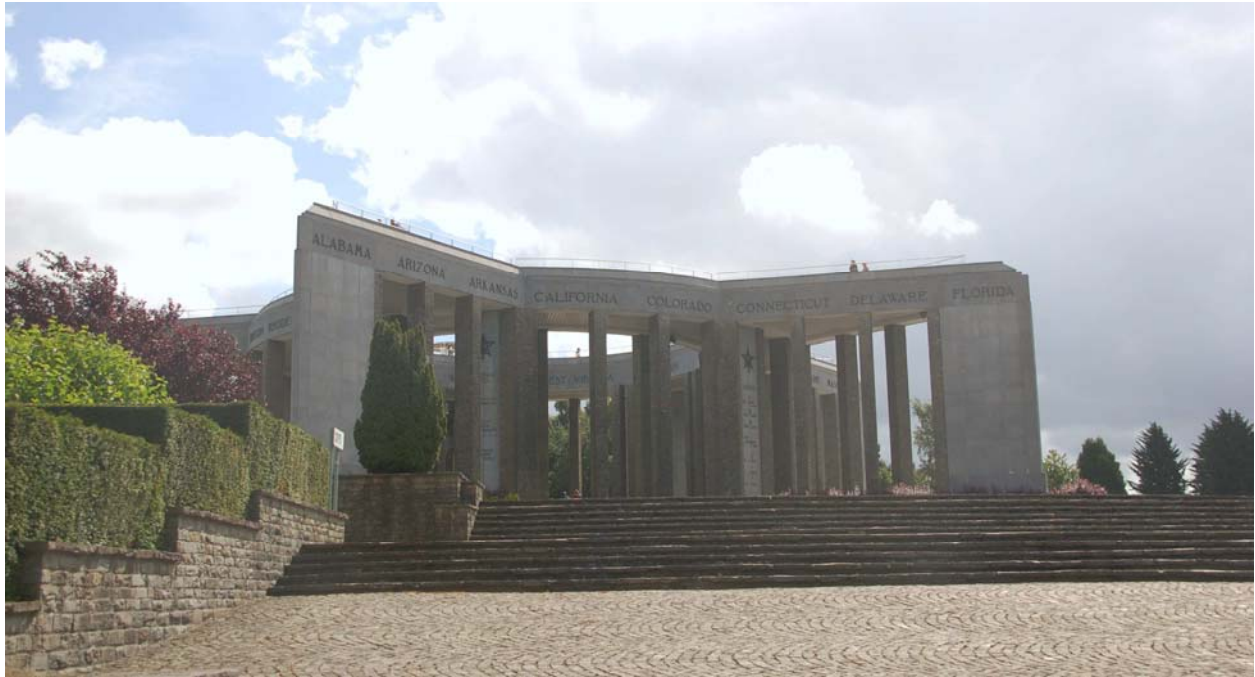
The Memorial at Bastogne, Luxembourg

The Bastogne memorial is massively impressive. The view of the surrounding countryside is superb. The memorial is laid out in a star with the names of the states on the top and the unit names on the columns.