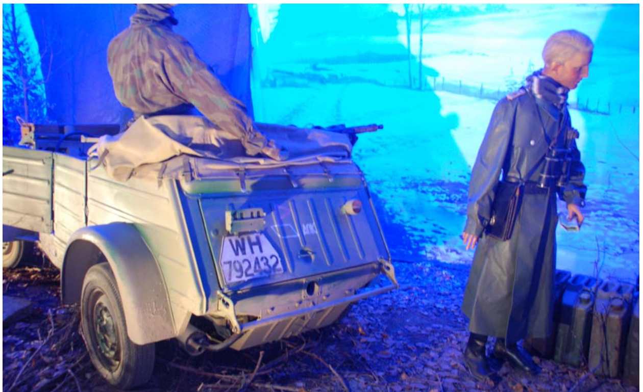
Both U.S. and German equipment, uniforms, weapons and memorabilia are displayed